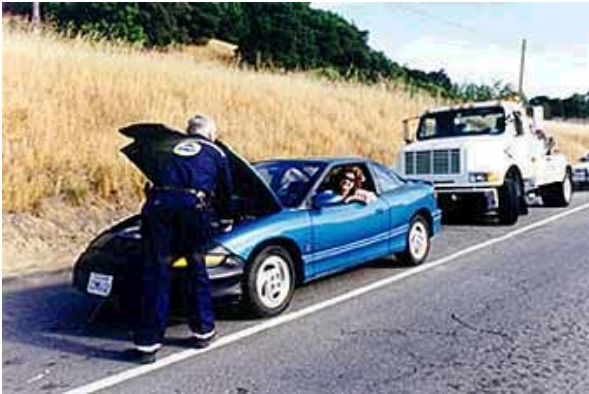
FSP trucks and tow trucks are white and prominently display the FSP logo.

In addition to reducing congestion, the Freeway Service Patrol program makes our freeways safer while providing valuable motorist assistance. By reducing congestion, it also helps improve local air quality. FSP is a free service provided jointly by the Placer County Transportation Planning Agency, Placer County Air Pollution Control District, California Highway Patrol, and Caltrans.